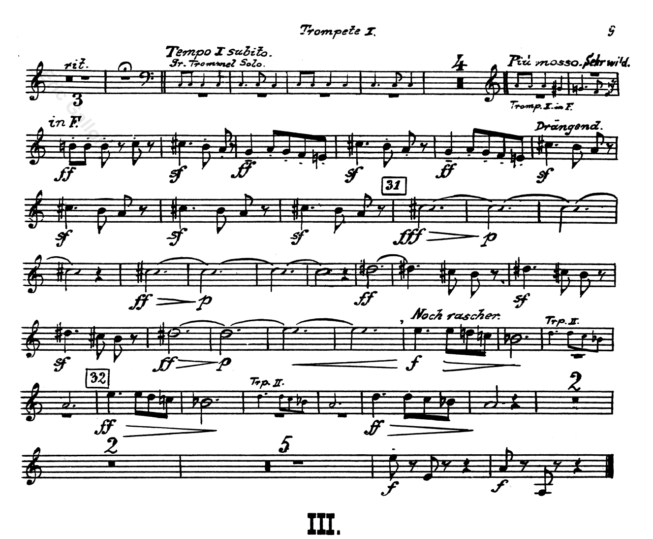
4. Adagietto (tacet.)